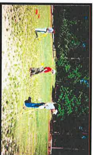
Investigation of an OOU for munitions

Remember the location of the suspicious items and call 911.