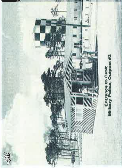
Entrance to Croft Military Police, Outpost #2

World War II brought about the need for more training facilities across the United States. James F. Byrnes, a S.C. Senator and Spartanburg native, was instrumental in bringing a training camp to the area. War Department negotiations for a proposed site in Delmar, five miles south of Spartanburg, were completed in late 1940 and ground breaking ceremonies were held on December 5, 1940.